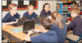
Daily access to Chromebooks