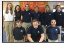
Student Council Opportunities